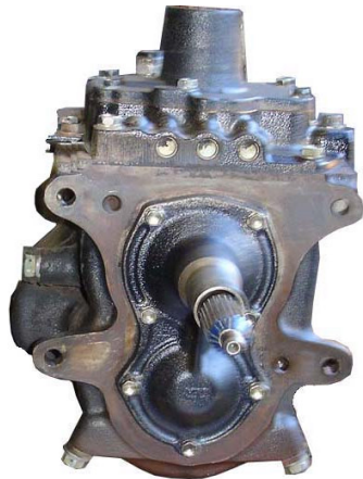
Rear wheel Drive Transmission